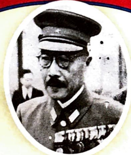
HIDEKI TOJO 1884–1948

U.S. newspapers described Hideki Tojo as "smart, hard-boiled, resourceful, [and] contemptuous of theories, sentiments, and negotiations."