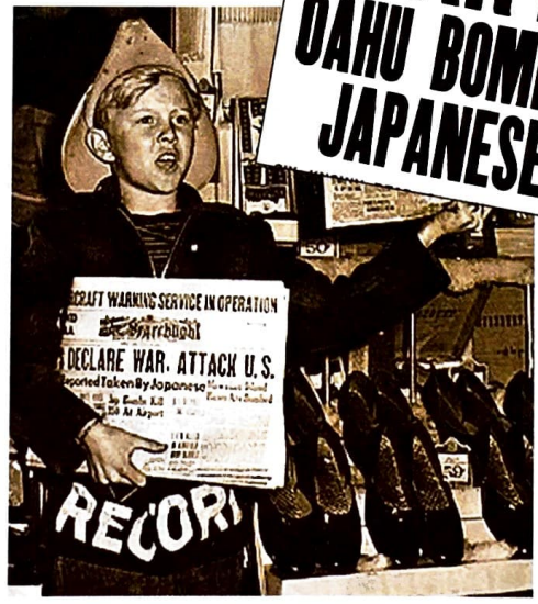
▲ Newspaper headlines announce the surprise Japanese attack.