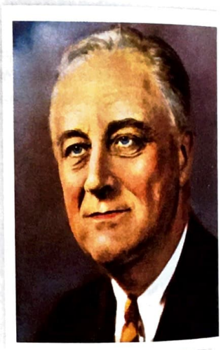
▲ Franklin D. Roosevelt

Although Roosevelt knew that Americans were still deeply committed to staying out of war, he also believed that there could be no peace in a world controlled by dictators.