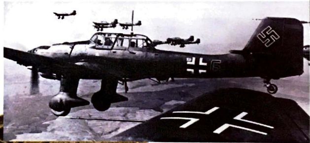
▲ German Junkers JU-87 dive-bombers, commonly known as Stukas, were a mainstay of Germany's blitzkrieg style of attack.

The blitzkrieg tactics worked perfectly. Major fighting was over in three weeks, long before France, Britain, and their allies could mount a defense. In the last week of fighting, the Soviet Union attacked Poland from the east, grabbing some of its territory. The portion Germany annexed in western Poland contained almost two-thirds of Poland's population. By the end of the month, Poland had ceased to exist—and World War II had begun.