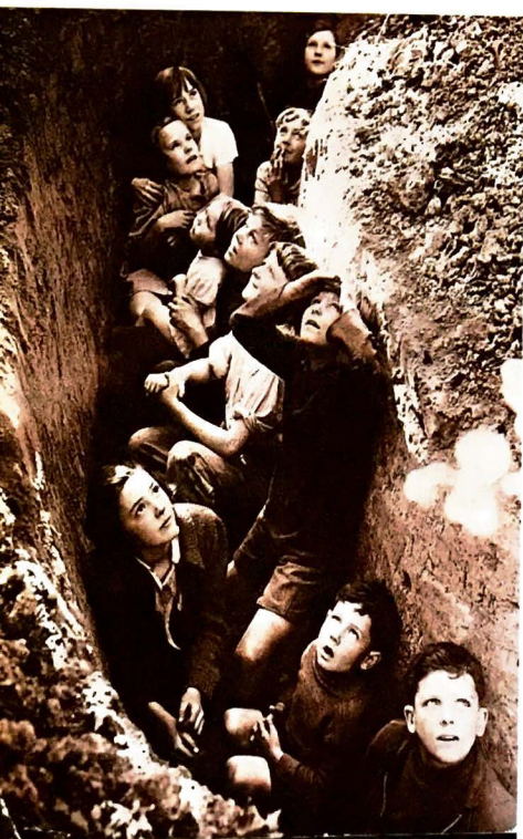
◀ Children watch with wonder and fear as the battling British and German air forces set the skies of London aflame.

THE BATTLE OF BRITAIN In the summer of 1940, the Germans began to assemble an invasion fleet along the French coast. Because its naval power could not compete with that of Britain, Germany also launched an air war at the same time. The Luftwaffe began making bombing