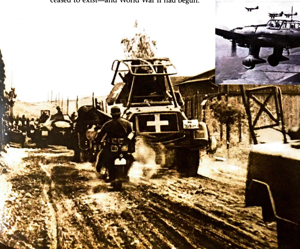
◀ A German tank unit in Western Poland in 1939.

☺ How did German blitzkrieg tactics rely on new military technology?